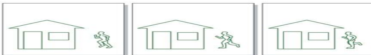
Fig 1. Motion JPEG format, the three images in the above sequence are coded and sent as separate unique images (I-frames) with no dependencies on each other.

To reduce video data between a series of frames, video compression algorithm uses inter frame prediction. This involves techniques like difference coding in which one frame is compared with a reference frame and only pixels that have changed with relevance to the reference frames are coded. The number of pixel values that's coded and sent is reduced in this way. The images appear as in the original video sequence when such an encoded sequence is displayed. In order to further reduce the information alternative techniques like block-based motion compensation are often applied. In block-based motion compensation it takes into